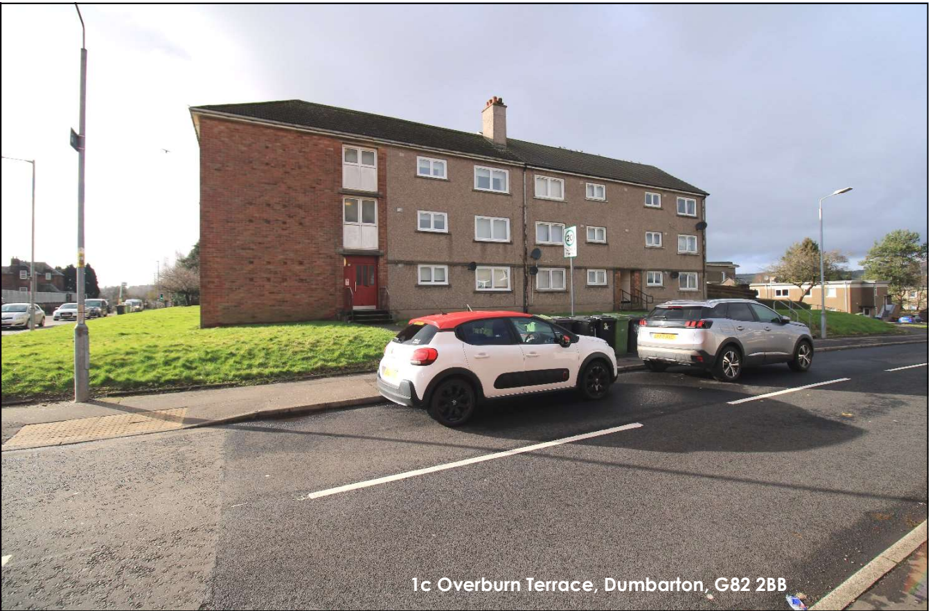
1c Overburn Terrace, Dumbarton, G82 2BB

This generously sized one bedroom first floor flat sits at the corner of Townend Road and is conveniently located for shops and rail and road links and would be ideal for first time buyers.